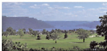
View of Lake from the model